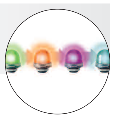
With RGB LEDs more than 200.000 colours can be selected

A wide range of colours and light effects can be quickly and simply programmed by the customer and altered at any time.